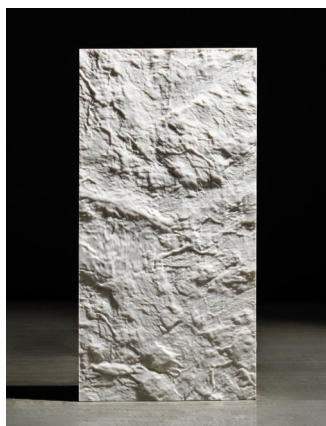
TAJ WHITE MARBLE