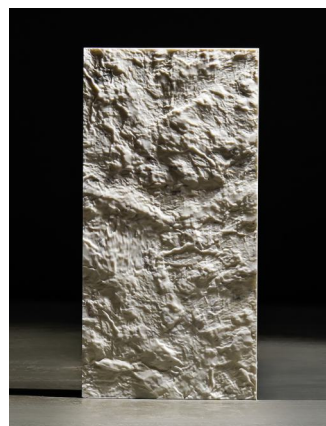
LAVENDER HUE MARBLE