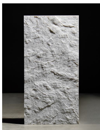
GREY FANTASY MARBLE