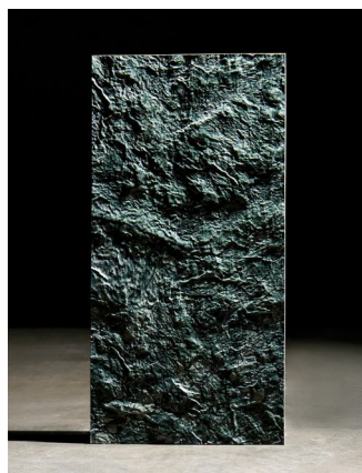
GUATEMALA GREEN MARBLE