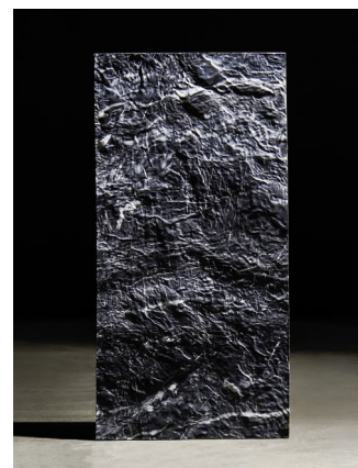
BLACK WAVE MARBLE